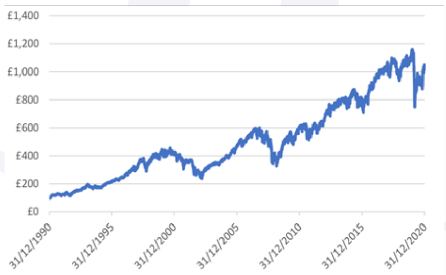
Return on £100 invested in the FTSE All-Share index

Please remember that past performance is not a guide to future performance and may not be repeated.